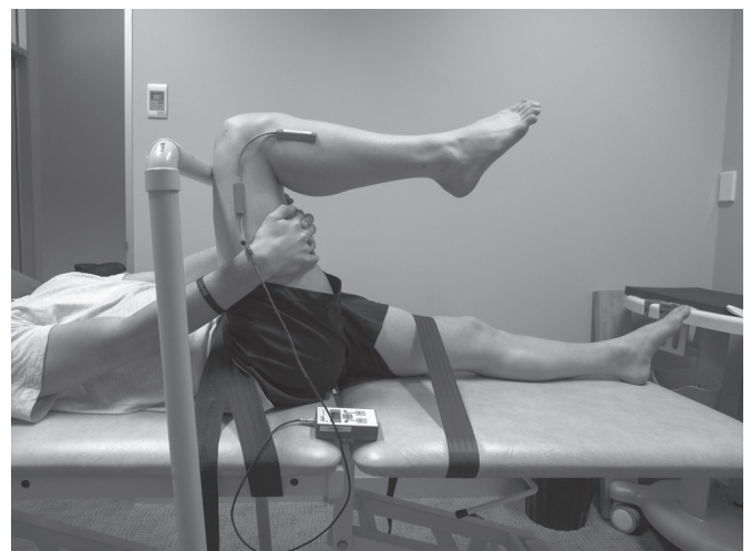
Figure 2: Start position of the active knee extension (AKE) test.

Prior to data collection, a pilot study assessing the intra-rater reliability of the AKE test was undertaken. Ten participants (mean age, 24.8 (SD 4.3) years; height, 172.9 (SD 6.1) cm; weight, 68.0 (SD 16.7) kg) from a sample of convenience took part in the reliability study. Using the data-collection procedures outlined earlier, two sets of measurements of active knee extension were completed on two separate occasions with 10 minutes intervals (Depino et al 2000, Spernoga et al 2001). The intra-class correlation coefficient (ICC, 2,1) for the paired data was 0.99, establishing excellent test-retest reliability (Bandy and Irion 1994, Bandy et al 1998, Ford et al 2005).